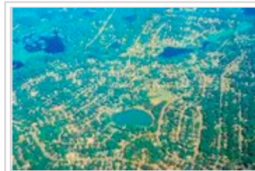
Lake conditions vary in this suburbanized residential area north of Tallahassee, region 65-04.