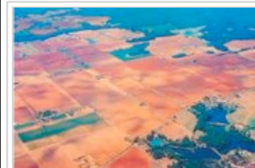
Small ponds and reservoirs on red sandy soils are typical in region 65-01.

76-04. The Southern Coast and Islands region includes the Ten Thousand Islands and Cape Sable, the islands of Florida Bay, and the Florida Keys. It is an area of mangrove swamps and coastal marshes, coral reefs, various coastal strand type vegetation on beach ridge deposits and limestone rock islands. Although freshwater habitats are limited or non-existent in this region, any freshwater that does occur for periods of time may have great ecological significance. Coastal rockland lakes are small in size and number, occurring primarily in the Florida Keys. These waters are alkaline, with high mineral content and highly variable salinity levels. The rockland lakes provide important habitat for several kinds of fish, mammals, and birds of the Keys. Reductions in the fresh groundwater lens that floats on the denser saline groundwater can severely affect these lakes.