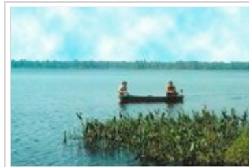
Sportfishing for largemouth bass, bluegill, and black crappie is an important recreational activity on Florida lakes. (Lake Crosby, 75-03).