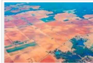
Small ponds and reservoirs on red sandy soils are typical in region 65-01.

65-03. The New Hope Ridge/Greenhead Slope is an upland sand ridge region, 100-300 feet in elevation, with a relatively high density of solution