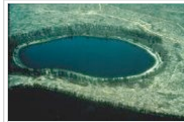
Clearcut logging around Lake Five-0 in region 65-03.

75-01. Several types of [[freshwater biomes#ponds and lakes]] lakes occur in the Gulf Coast Lowlands lake region, including coastal dune lakes, flatwood lakes, "edge lakes", river floodplain or oxbow lakes (Dead Lake), and reservoirs (Deer Point Lake). Most of the lakes tend to be darkwater, acidic, softwater lakes with low to moderate nutrients. Coastal dune lakes have higher sulfate, sodium, and chloride levels than inland lakes, and can freshen or turn salty depending on rainfall, saltwater input, or salt spray. Flatwood lakes receive the majority of their water from direct rainfall and runoff from surrounding poorly drained soils. Sag ponds or "edge lakes" are found at the foot of relict marine terrace scarps or where soluble limestone that is near the surface abuts an upland of thick insoluble sands. An example is Chunky Pond near the western edge of the Northern Brooksville Ridge (75-05).