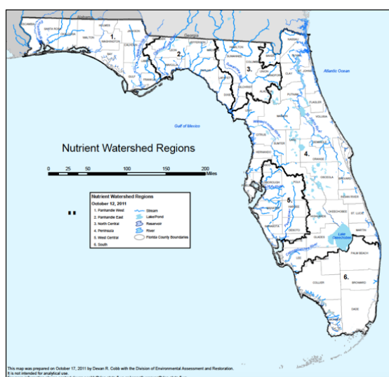
Figure 1. Map showing nutrient thresholds areas for streams set forth by FDEP.

For decades Florida has had a narrative nutrient water quality criterion in place to protect Florida’s waters against nutrient over-enrichment. In 2009, the Florida Department of Environmental Protection (FDEP) initiated rulemaking and, by 2011, adopted what would be the first set of statewide numeric nutrient standards for Florida’s waters. By 2015, almost all the remaining waters in Florida have numeric nutrient standards (see for FDEP Regulation Nutrient Criteria’s for: Streams, spring vents: https://www.flrules.org/gateway/RuleNo.asp?title=SURFACE%20WATER%20QUALITY%20STANDARDS&ID=62-302.531 ).