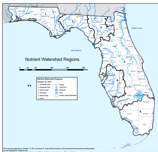
Figure 1. Map showing nutrient thresholds areas for streams set forth by FDEP.

For decades Florida has had a narrative nutrient water quality criterion in place to protect Florida’s waters against nutrient over-enrichment. In 2009, the Florida Department of Environmental Protection (FDEP) initiated rulemaking and, by 2011, adopted what would be the first set of statewide numeric nutrient standards for Florida’s waters. By 2015, almost all the remaining waters in Florida have numeric nutrient standards (see for FDEP Regulation Nutrient Criteria’s for: Streams, spring vents: https://www.flrules.org/gateway/RuleNo.asp?title=SURFACE%20WATER%20QUALITY%20STANDARDS&ID=62-302.531 ).