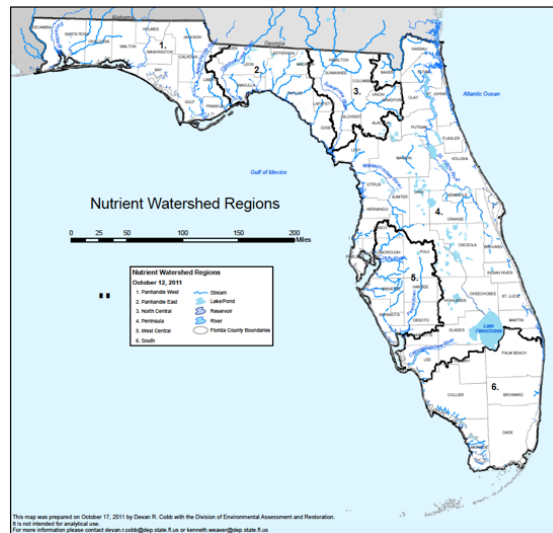
Figure 1. Map showing nutrient thresholds areas for streams set forth by FDEP.

For decades Florida has had a narrative nutrient water quality criterion in place to protect Florida’s waters against nutrient over-enrichment. In 2009, the Florida Department of Environmental Protection (FDEP) initiated rulemaking and, by 2011, adopted what would be the first set of statewide numeric nutrient standards for Florida’s waters. By 2015, almost all the remaining waters in Florida have numeric nutrient standards (see for FDEP Regulation Nutrient Criteria’s for: Streams, spring vents: https://www.flrules.org/gateway/RuleNo.asp?title=SURFACE%20WATER%20QUALITY%20STANDARDS&ID=62-302.531 ).