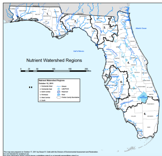
Figure 1. Map showing nutrient thresholds areas for streams set forth by FDEP.

For decades Florida has had a narrative nutrient water quality criterion in place to protect Florida’s waters against nutrient over-enrichment. In 2009, the Florida Department of Environmental Protection (FDEP) initiated rulemaking and, by 2011, adopted what would be the first set of statewide numeric nutrient standards for Florida’s waters. By 2015, almost all the remaining waters in Florida have numeric nutrient standards (see for FDEP Regulation Nutrient Criteria’s for: Streams, spring vents: https://www.flrules.org/gateway/RuleNo.asp?title=SURFACE%20WATER%20QUALITY%20STANDARDS&ID=62-302.531 ).