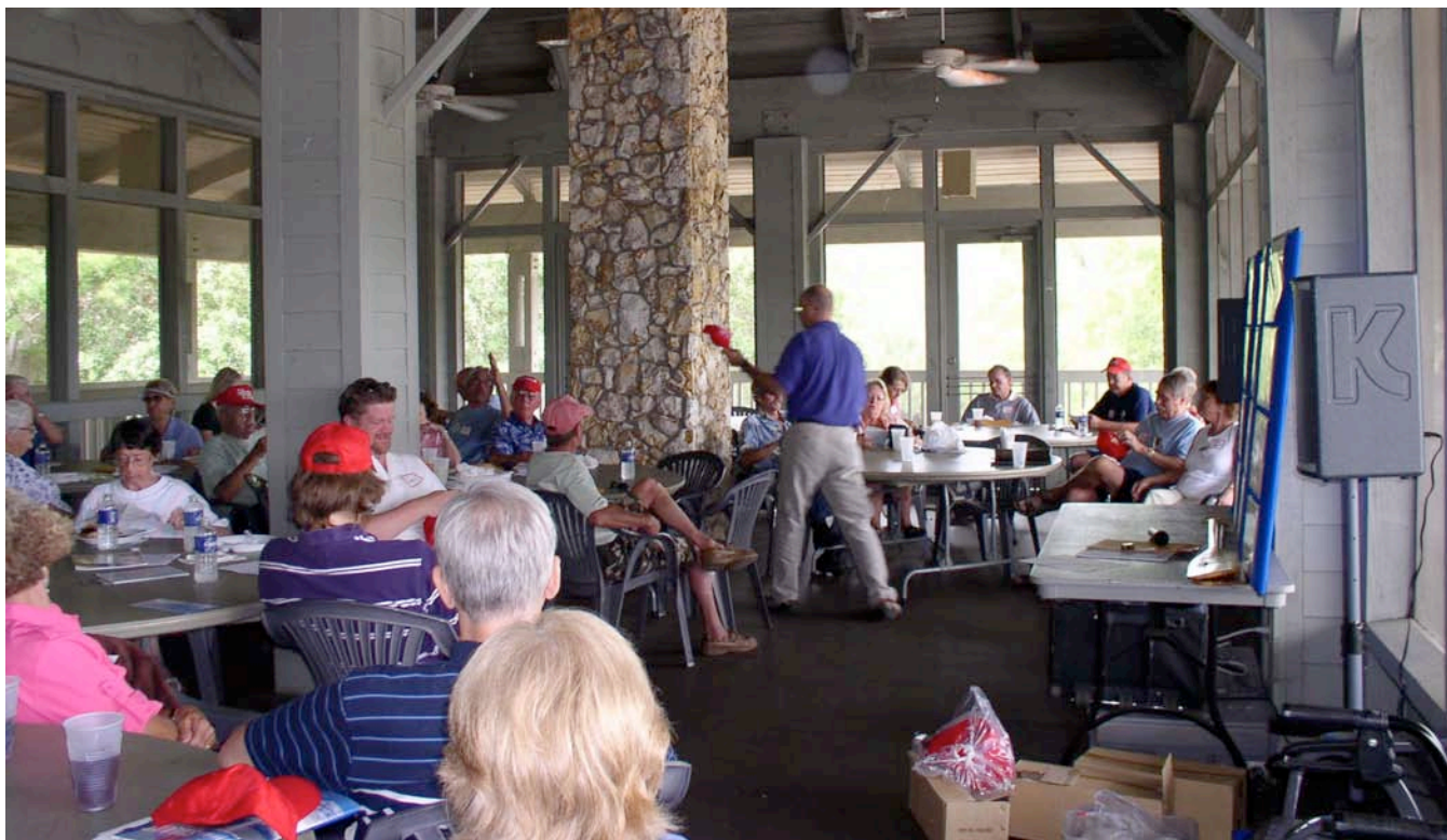
The Florida LAKEWATCH volunteer appreciation meeting for Lake County at the Hickory Point Facility in Tavares.

We look forward to working with our volunteers in 2011 and hope that if you have any questions that you will not hesitate to contact us.