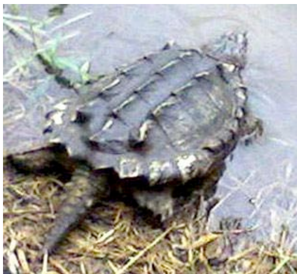
An alligator snapping turtle at the edge of the lake.

Freshwater turtles can only be taken by hand, dip net, minnow seine or baited hook. Most freshwater turtles may be taken year-round. Taking turtles with bucket traps, snares, or shooting with firearms is prohibited. Softshell turtles may not be taken from the wild from May 1 to July 31. In addition, collecting of freshwater turtle eggs is