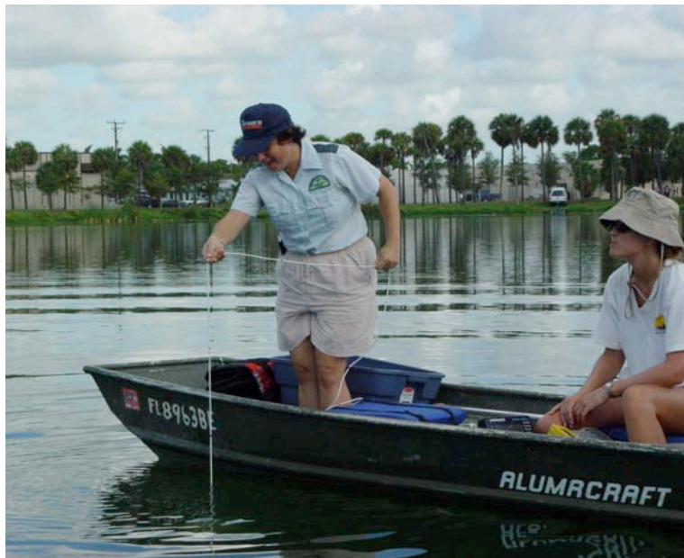
A LAKEWATCH volunteer measuring water clarity on Lake Delevoe in Broward County.

Florida LAKEWATCH has always tried to adhere to these guiding principals because LAKEWATCH began as a grass-root organization. Florida LAKEWATCH was established in 1986 when citizens from Lake Broward and Lake Santa Fe came to my office at the University of Florida seeking help with various water quality issues at their lakes.