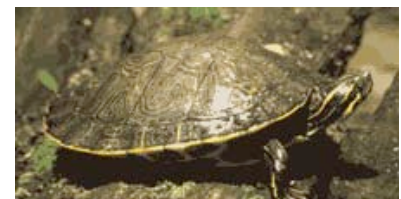
A Suwannee cooter ( Pseudemys suwanneensis ).