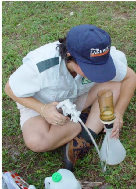
A LAKEWATCH volunteer filtering their chlorophyll sample.

complement by extension in space and time a more rigorous but limited research program. The Advisory Committee for Environmental Research and Education also stated that “Citizen Scientists” provide a means to help bridge the gap between basic and applied research.