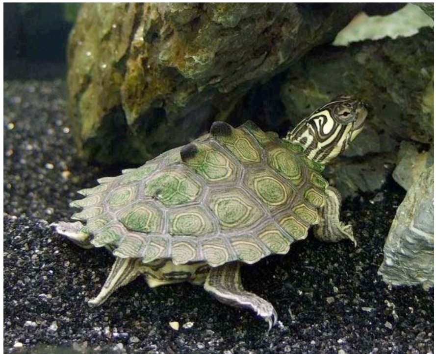
A Barbour's map turtle ( Graptemys barbouri ).

Concerned with increasing popularity of turtles and the potential for over-harvest, the Florida Wildlife Conservation Commission passed an interim rule in September 2008 to protect turtle species. A team of staff has developed a long-term turtle conservation strategy that will propose long term protection measures. New protections were approved by the Commission at