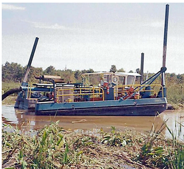
Dredging removes bottom muck allowing rooted plants to grow and successful fish spawning.