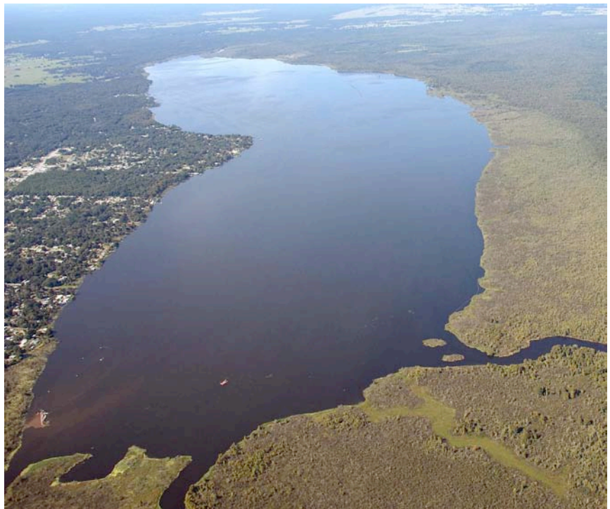
An aerial view of Lake Panasoffkee in Sumter County.

Lake Panasoffkee, designated an Outstanding Florida Water, is a 4,460-acre Fish Management Area in Sumter County, near Interstate 75. In the 1950s, it was one of the state's best places to fish, with 15 active fish camps. However, by 1998, 12 of those camps had closed. A major