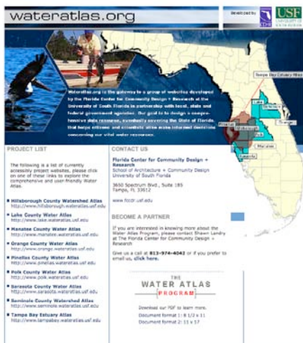
The University of South Florida's WATERATLAS website. wateratlas.org

LAKEWATCH disseminates information directly to the public via the volunteers and through the University of South Florida's WATERATLAS ( wateratlas.org ).