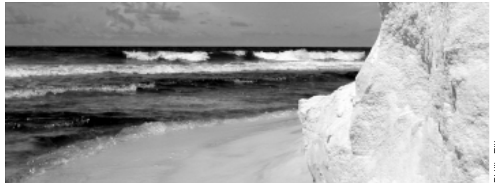
Lake Stalworth, one of Florida’s unique dune lakes found in Walton County, is temporarily connected to the Gulf of Mexico, as shown here.