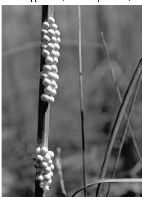
Florida applesnail eggs