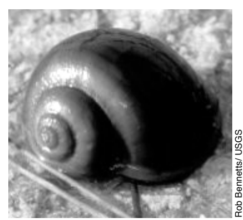
Florida applesnail (Pomacea paludosa)

Gary Warren / Invertebrate Biologist Florida Fish & Wildlife Conservation Comm. 7922 NW 71st Street Gainesville, FL 32653 352/392-9617 ext. 279 gary.warren@fwc.state.fl.us