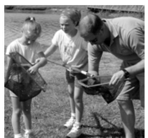
Kids love the hands-on part of the Fishing For Success program, and so do dads!