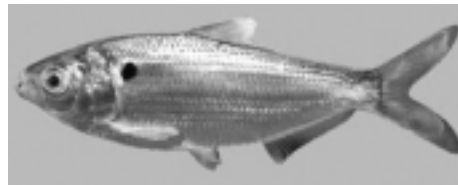
Threadfin shad ( Dorosoma petenense )