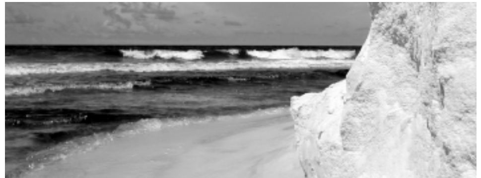
Lake Stalworth, one of Florida’s unique dune lakes found in Walton County, is temporarily connected to the Gulf of Mexico, as shown here.