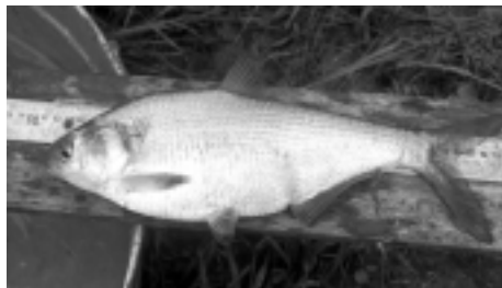
Gizzard shad ( Dorosoma cepedianum )