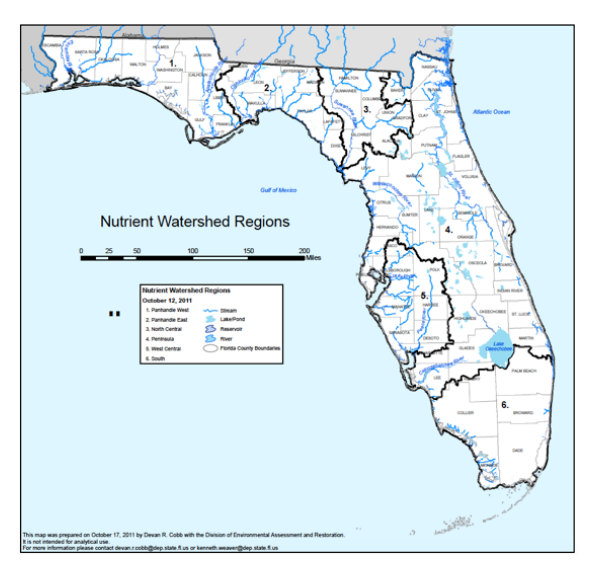
Figure 1. Map showing nutrient thresholds areas for streams set forth by FDEP.

https://www.flrules.org/gateway/RuleNo.asp?title=SURFACE%20WATER%20QUALITY%20STANDAR DS&ID=62-302.531).