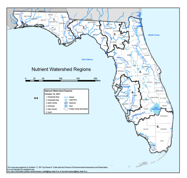
Figure 1. Map showing nutrient thresholds areas for streams set forth by FDEP.

https://www.flrules.org/gateway/RuleNo.asp?title=SURFACE%20WATER%20QUALITY%20STANDAR DS&ID=62-302.531).