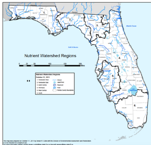
Figure 1. Map showing nutrient thresholds areas for streams set forth by FDEP.

For many decades Florida has had a narrative nutrient water quality criterion in place to protect Florida's waters against nutrient over-enrichment. In 2009, the Florida Department of Environmental Protection (FDEP) initiated rulemaking and, by 2011, adopted what would be the first set of statewide numeric nutrient standards for Florida's waters. By 2015, almost all of the remaining waters in Florida have numeric nutrient standards (see for Florida Department of Environmental Regulation Nutrient Criteria's for: Streams, spring vents: http://www.dep.state.fl.us/water/wqssp/nutrients/index.htm ).