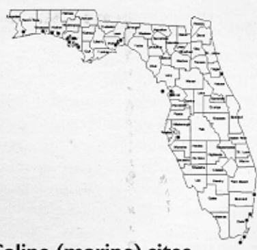
Saline (marine) sites monitored by Florida LAKEWATCH/Project COAST volunteers in 2000

This year's LAKEWATCH/Project COAST program is off to a strong start. The combined monitoring of both inland and marine waters around the state has not only made things busy for our crew, but also productive!